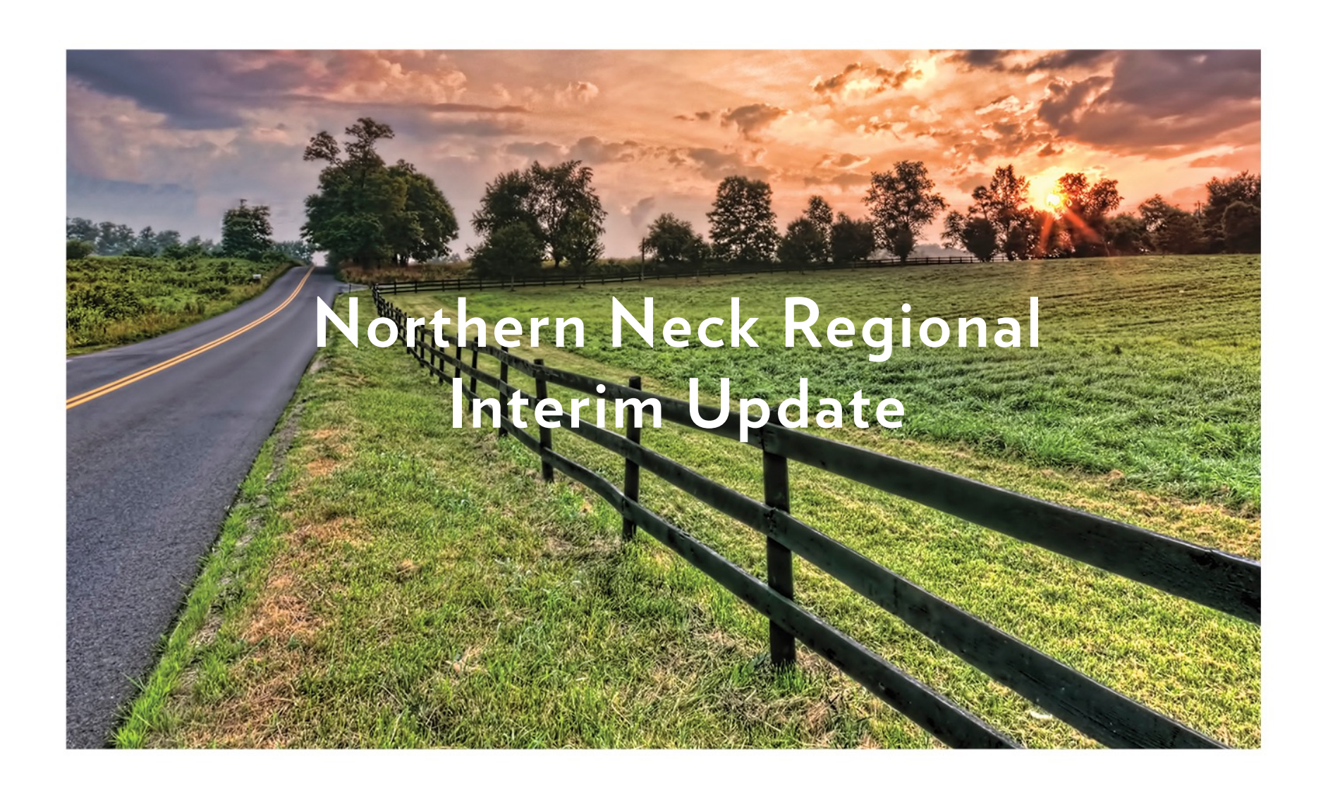
November 5, 2021